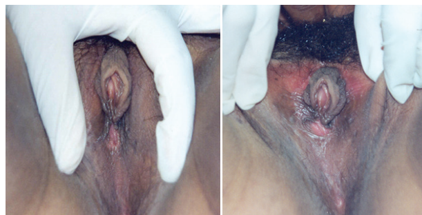
Figure 1. Pictures of the patient's external genitalia.

Mild hypertension was also found. Hormonal and electrolytic determinations as well as semen analysis and karyotyping were the preliminary examinations conducted. No skeletal malformations were noted, while X-rays of the upper and lower extremities were normal. Based on the study by Krone et al, 16 the malformation scoring system for PORD patients,