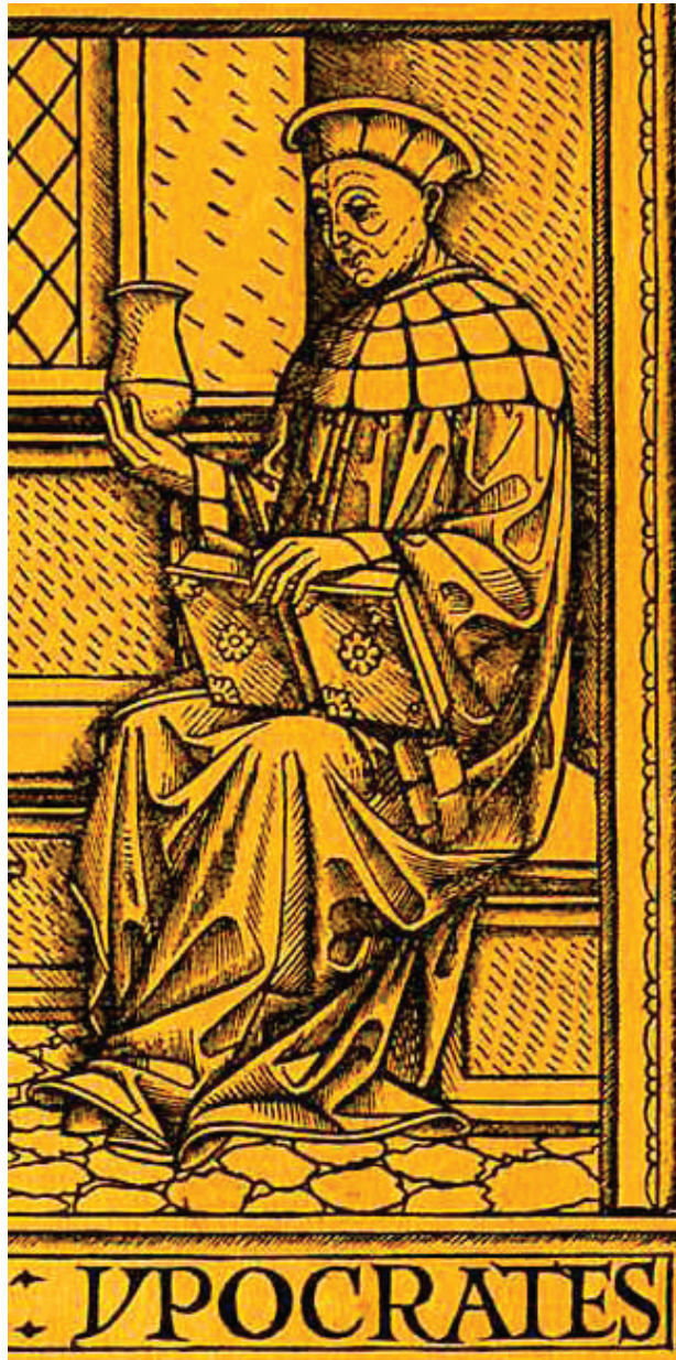
Figure 1. Hippocrates and uroscopy: part of a woodcut from an early 15th century, Latin language medical book.

It is striking to read today this very perceptive description by Hippocrates: "...the fluids are sucked from the veins to the kidneys, then the watery substance appears to be distilled by the kidneys, where the urine is filtered and separated by the blood" (Greek fragment: και το υγρό τραβιέται από τις φλέβες στους νεφρούς, έπειτα, το ύδωρ σα να διωλίζεται από τα νεφρά [...] και εκεί τα ούρα διωλίζονται και αποχωρίζονται από